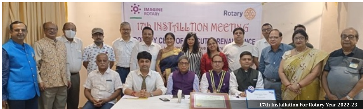
17th Installation For Rotary Year 2022-23